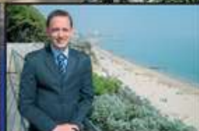
7 Government funding for Bmth