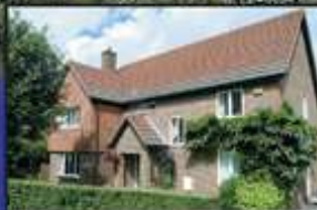
10 Hot property of the week