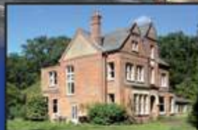
4 Through the keyhole