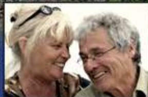
27 Retirement Living

You can also search online at bournemouthecho.co.uk/property